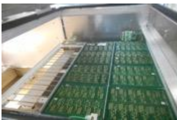
Transport of boards into the process chamber

The VAC-Series is an environmentally friendly and flexible soldering system dedicated for highest quality soldering. The patented vacuum chamber located in the process chamber ensures that highest solder quality with a minimum amount and size of voids is possible. Outstanding performance and quality results through the unique technology applied in these machines. Regardless of the number of layers in the board and high mix of components this machine can handle the toughest applications with fantastic results. The Intelligent Profiling System gives the user full control of temperature rise to reach the best and desired soldering profiles. Together with the unique patented Soft Vapour Phase there is no fear of exceeding temperature increase rates of components. Their outstanding low energy consumption and exhaust air volume compared to other soldering systems result in even lower running costs. Excellent heat transfer in an inert oxygen free atmosphere without the need of costly nitrogen. Two chamber system with a large touch display makes this machine user friendly, easy to set up and use. Soldering is possible regardless of assembly weight with the same profile.