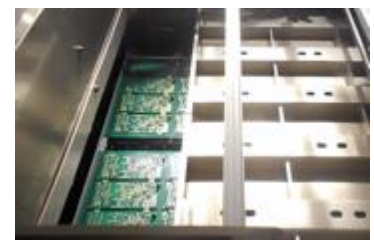
Vacuum unit inside of process chamber